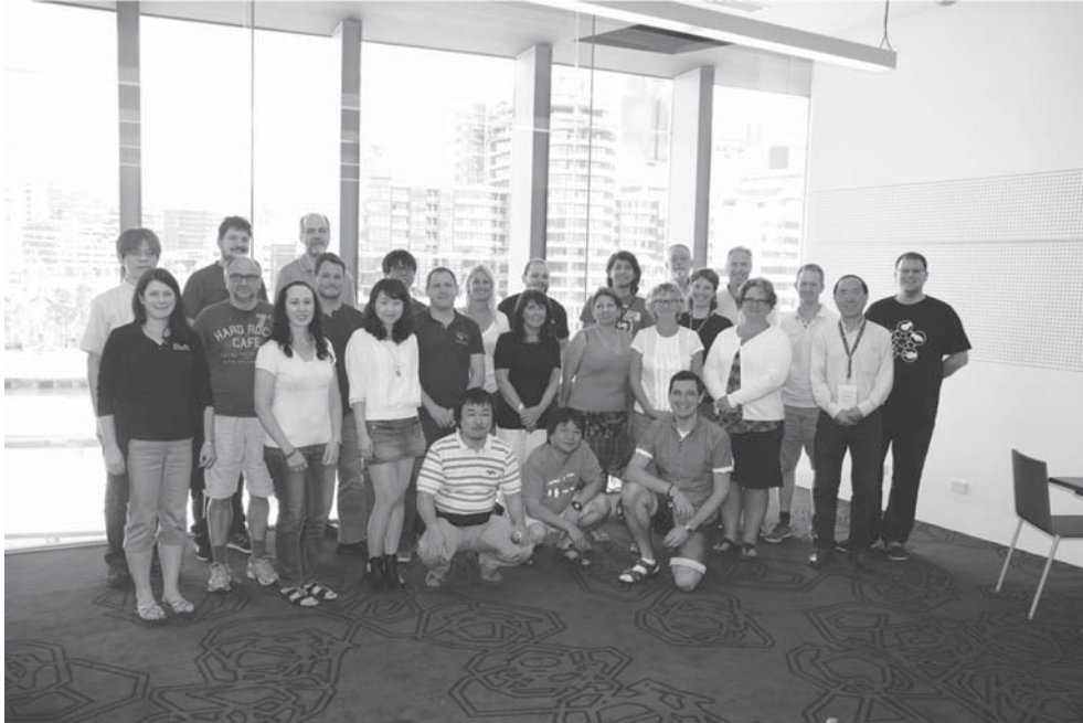
Figure 10: The group photo taken at the last JACoW Team Meeting in Melbourne, Australia in January 2015.

Team Meetings and their travel to participate in a proceedings office team either within their series, or at a major event such as IPAC (Fig. 10 is the group photo taken at the last JACoW Team Meeting in Melbourne, Australia in January 2015),