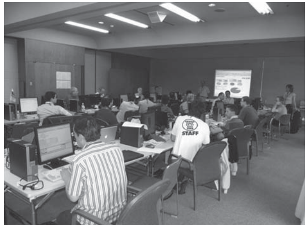
Figure 4: View of an IPAC Proceedings office. Around 20 editors representing most JACoW events work flat out prior to and during a conference week, to publish all papers “pre-press” on the last day of the conference.

The best possible training in processing texts and transparencies is during a conference, in particular the larger events such as IPAC, when editors can get a complete overview of the process, which runs through the SPMS editorial module, whereby a contribution uploaded by an author is rendered publishable. This involves accessing the contribution by the editor, who checks that the paper respects the JACoW template, that the figures display correctly, and that the figures, references and