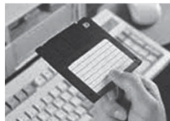
Figure 1: Reminder of what a diskette looked like in the mid-nineties.

PAC'95 authors had been asked to hand in their contributions to the conference proceedings on diskettes together with a hard paper copy. Figures 1 and 2 show examples of a diskette and a CD-ROM for younger readers. More mature readers will be reminded of how much our tools and technology have