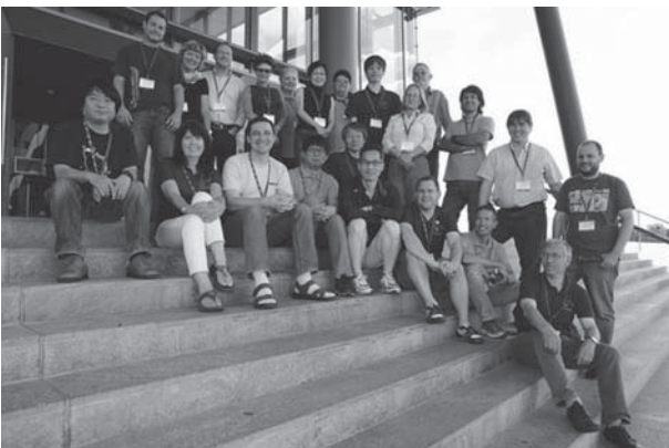
Figure 6: The JACoW “Saltmines” Team at IPAC’14.

The annual Team Meetings, which rotate around the regions, are the occasion for all team members to come up to date with new software and techniques, new SPMS functionality, etc. and to plan for the implementation of new functionality or procedures as requested by Stakeholders (see below). The announcements, programmes and organization of the Team Meetings are published at the JACoW.org site.